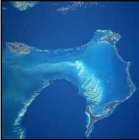
New Providence, The Bahamas