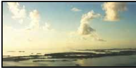
Exumas, The Bahamas