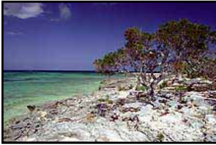
Cat Island, The Bahamas